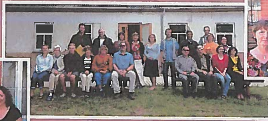
2015 LATVIA TEAM & CAMP HOSTS